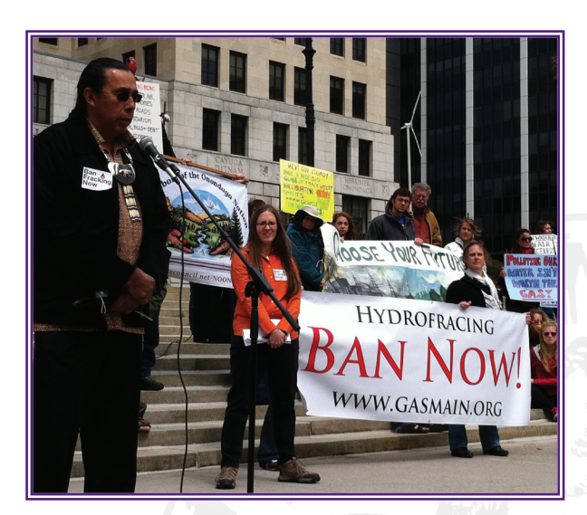
Grassroots organizations have asked Onondaga Nation leaders to speak at many events against hydrofracking

school; it would have brought in 110 cars of coal a day through the City of Syracuse and shipped its byproducts, such as sulphuric acid, on the same tracks. This operation's promise of carbon capture was no more than a pipe leading to nowhere, venting CO2 into the atmosphere. When local opposition mounted, the plant was then proposed for Scriba, NY. The Onondaga Nation lent its assistance to both the Jamesville Positive Action Committee (JAM-PAC) and the Scriba Coalition of Responsible Citizens, raising concerns with the New York State Department of Environmental Conservation (NYSDEC) through its government-to-government consultation relationship, and providing extensive background research to the Syracuse Post-Standard and the neighbors opposing the plant. Both communities were successful in keeping the plants out.